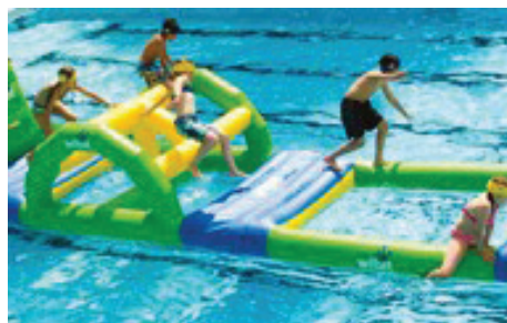
New 54 Foot WIBIT Aqua Track at Nor-Gwyn Pool

As the only 50 meter Olympic size pool in the area, Nor-Gwyn trained swimmers have